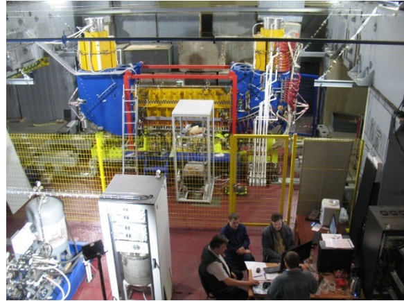
Figure 3: Experiments with electron beam.

intermediate energy where cooling method will be again applied.