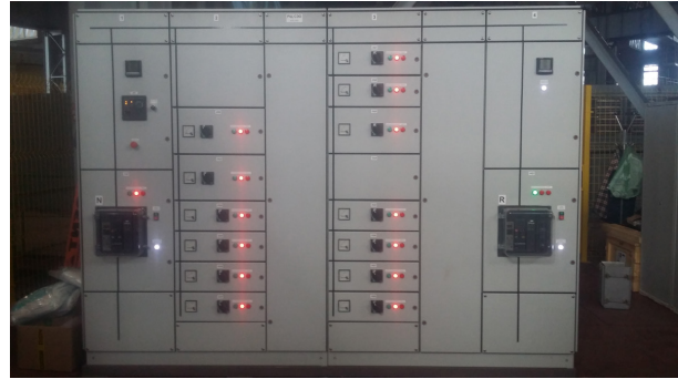
Figure 2: Main electrical rack.

At present (as of October 2018) a new electrical rack with a capacity of 700 kW and a new cable system which will enable the Electron Cooling System operate at full power are being prepared for commissioning (Fig. 2).