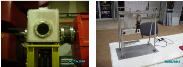
Figure 1: Vacuum box and rotation mechanism of horizontal wire scanner.

Both boxes are rigged with viewing quartz windows for easy control of the wire condition. In addition, each box has a vacuum pump PVIG-250 type. The motor shaft in both units is connected to the aluminum fork shaft by means of a metal bellows coupling type WK 3/15. Shaft bearings of vacuum design are installed at the ends of the forks.