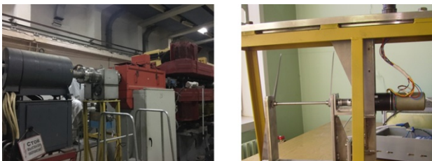
Figure 2: Vacuum box and rotation mechanism of vertical wire scanner.