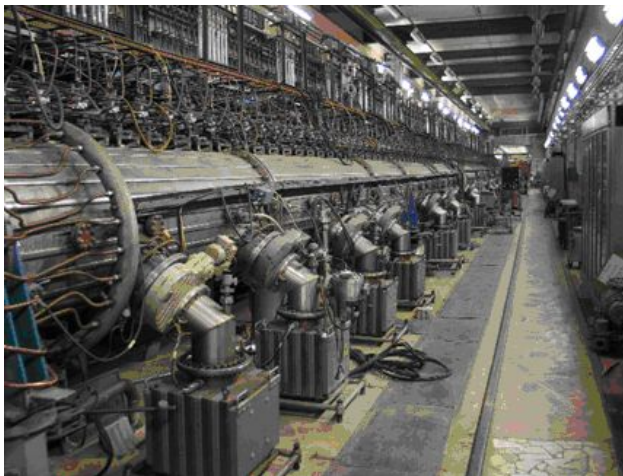
Fig.2 DTL part of the Linac

The nearest tasks we are planning for the Linac are as follows: