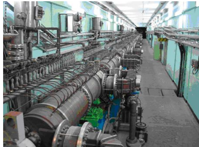
Fig.3 CCL part of the Linac

The tasks and problems to be solved for a further Linac operation take place because of the machine age as well as common situation in industry. First of all a number of klystrons on hand now limiting proton energy by 209 MeV instead of designed 600 MeV. Many efforts have to be done to restore the klystron production in industry or to have an appropriate funding to design and produce it at some firm abroad (we have offers from Toshiba and Thales). Stopping of some RF and modulator tubes production require replacement them by available ones with corresponding modernization of rf stations (for instance tube GI-54A will be replaced by GI-71A, GI- 51A by GI-57A). Some drift tubes of the DTL part should be repaired or replaced by new ones and it's in progress now.