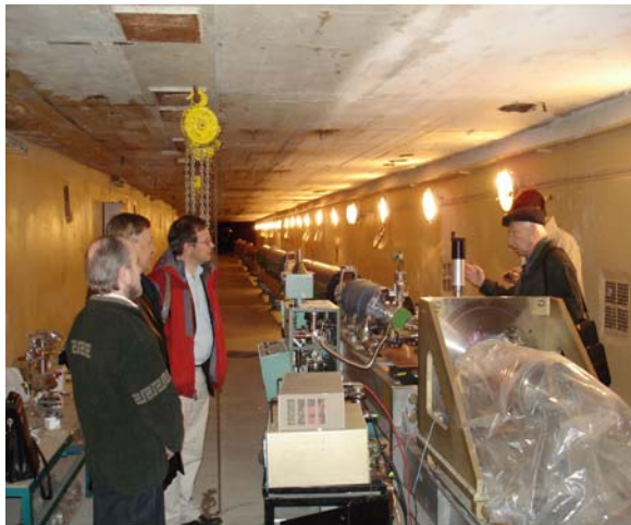
Figure 2: the injector of electrons with buncher, short accelerating section and four long accelerating section.

During realization of LINAC-800 project the injector of electrons with buncher, short accelerating section and four long accelerating section have been assembled (Figure 2). The injector and accelerating sections power supply units were installed.