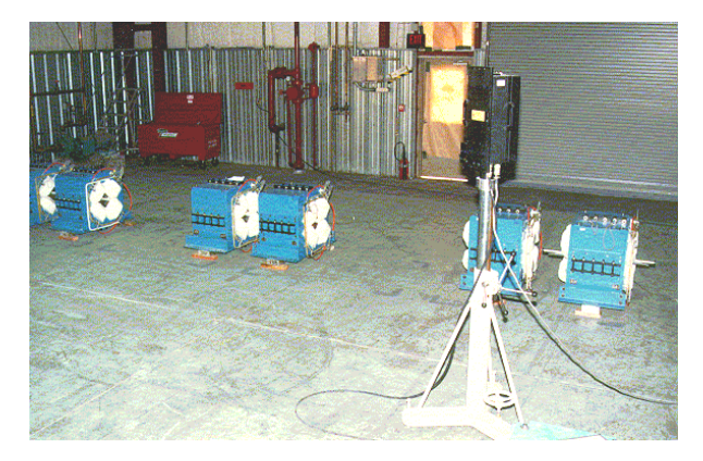
Figure 3 Six magnets ganged for fiducialization

magnet center by the average of magnet end positions, and remaining coordinate axis orientation by a best-fit plane through lamination edge coordinates.