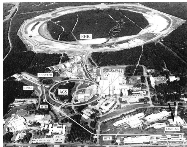
Figure: 1 The RHIC accelerator complex at BNL. The tandem Van de Graaff facility (lower right) is the initial RHIC preinjector for Au ion beams.

The mass of uranium is 20% higher than gold ( 238/197 = 1.21 ), but it is estimated [3] that the energy density in U+U collisions at RHIC will be 1.8 times higher than for Au+Au. This nearly factor of two enhancement occurs because the U nucleus is deformed (cigar shaped), while the Au nucleus is spherical. The randomly tumbling U nuclei will sometimes collide end to end producing the much higher energy densities and a 20% increase in the initial temperature. In addition, for central U+U collisions the range of transverse energies and particle multiplicities (due to the variation from end-to-end to side-to-side interactions) will be much larger than for central collisions of spherical nuclei, like Au.