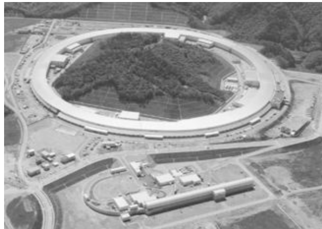
Figure 1: Aerial view of the SPring-8 facility. The storage ring is built surrounding a small mountain. The injectors are below the storage ring in the figure.

rays in the energy range from 5keV (fundamental) to 75keV (fifth harmonics) from a newly developed in-vacuum undulator with a period length of 32 mm simply by changing its gap.