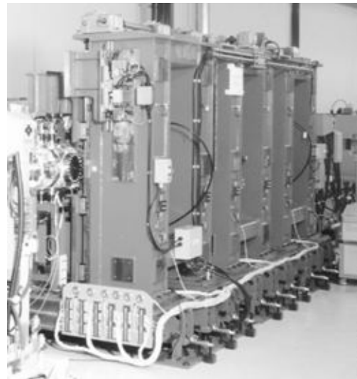
Figure 3: An in-vacuum undulator installed in the storage ring

Insertion device is a key technology for the third generation SR sources, especially for SPring-8. Most of excellent features of synchrotron radiations such as high brilliance, tunability over a wide range of wave length,