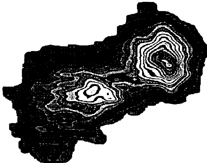
Figure 2: Beam with a Wakefield Tail.

The first experimental results with a beam on the screens have shown their usefulness in getting a visual colored picture of the beam. Fig. 2 shows, for instance, a beam with a huge wakefield tail. Steering the beam flat to the axis of the linac decreases the tail by a large amount. But at high currents, even with a well steered linac, tails are present. These can be decreased by introducing betatron oscillations with a certain phase and amplitude, so that no tails are visible on the screens.