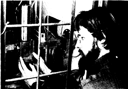
Figure 3. Experimental Hutch

The basic hutch and interlock system concept has worked well since 1974. It permits rapid, independent and convenient access to each of several simultaneous experiments. Hutches have grown in size to accommodate larger experiments and hutch doors have also grown in size to permit better access by the experimenter. For such larger hutches a sliding gate is installed parallel to the door which prevents a person from entering the hutch when the door is opened. The gate is padlocked shut whenever the system is "On-Line," i.e. whenever the shutters can be opened if the hutch door is closed. The gate has openings large enough for small pieces of equipment and also for hands to reach through (see figure 3) but too small to permit a person to enter the hutch.