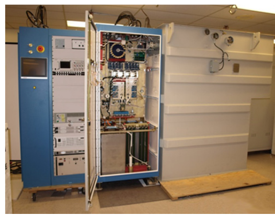
Figure 1: DTI's prototype solid-state ESS-class klystron modulator, developed under a DOE SBIR grant.

Diversified Technologies, Inc. (DTI), in partnership with SigmaPhi Electronics (SPE), has designed and installed advanced, high voltage solid-state modulators for European Spallation Source (ESS)-class klystron pulses (Figure 1). These klystron modulators use a series-switch driving a pulse transformer, with an advanced, patent-pending regulator to maintain a precise cathode voltage as well as a constant load to the external power grid. The success of the design in meeting the ESS pulse requirements (Table 1) is shown in Figure 2.