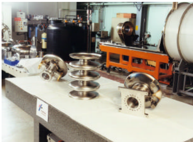
Figure 3. Beam tube cut-off and an intermediate part formed by EB-welding of dumb-bells prior to the final EB-welding.

Before each EB-welding operation, parts were thoroughly cleaned (buffered chemical polishing, 1:1:1), rinsed in ultra-pure water, and dried under ultra-pure N_2 . Adherence to this procedure was carefully checked and documented on the sign-off sheet in the traveller.