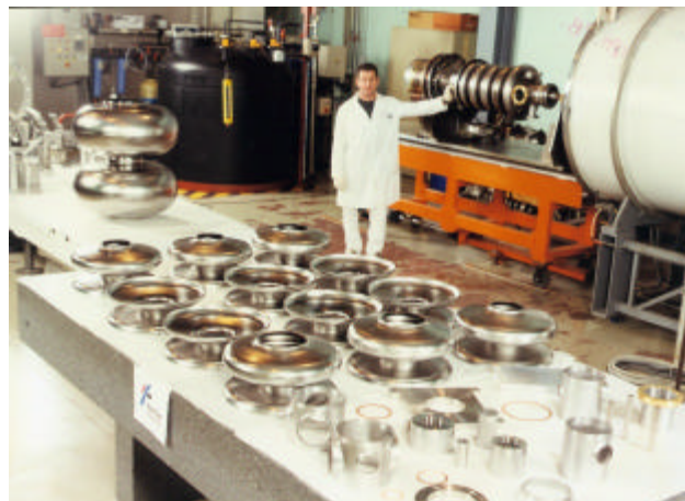
Figure 2. Fabrication of ED&D SCRF cavities at CERCA. In the foreground are “dumb-bells” formed by EB-welding of half-cells. In the background, a finished cavity is removed from the EB welder’s chamber.

Beam tube cut-offs and PC ports were made from Nb grade 250 material, while the HOM ports and RF pick-up tube were made from (reactor) RRR grade 40 material. Stainless steel CONFLAT ® flanges were brazed to Nb tubes using a procedure developed by CERCA.