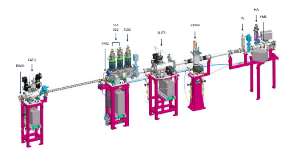
Figure 2: The scheme of the front end section. Main components from right to left: FM1 (fixed mask1), HA (heat absorber), FV (fast valve), XBPM (X-ray beam position monitor), SLITS (white beam slit unit), FLSC (fluorescent screen), SS1&SS2 (cooling double safety shutters), FM2 (fixed mask2), FATU (Filter assembly trigger unit) and BWIN (beryllium window).

To fulfil presented functionality, we have defined sequence of the devices presented in Fig. 2. With presented sequence it is able to monitor beam position by keeping the XBPM device at the hot front end part and define radiation cone delivered to the beamline using dedicated slits unit. The front end section is finished with cooled beryllium window which separates the vacuum between the storage ring and the beamline during normal operation.