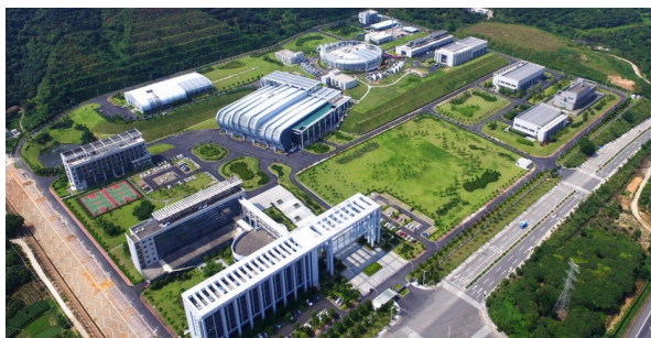
Figure 1: CSNS project aerial image.

For the last decades, high power proton linac (HPPL) has been an important subject for all accelerator researchers. Not only Spallation neutron source, like CSNS in Fig. 1, but also accelerator driven system (ADS) need high power proton linac as injector. Both are hot research topics and both have many questions to be studied. Simulation is the most important research method at present, which means researchers need to choose the best tool for their work, or develop their own code.