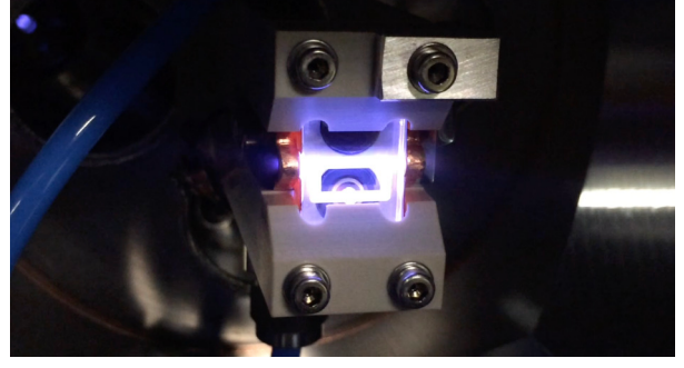
Figure 3: The plasma lens capillary in operation.

may Active plasma lenses are a promising new technology for strongly focusing charged particle beams, and their compact size is an advantage for potential use in combi-.≅ nation with novel high gradient acceleration methods. Still, many questions remain on such lenses, from e.g., their transverse field uniformity and the limitations due to beam excitation of plasma wake-Content fields.