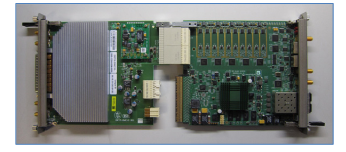
Figure 1: MicroTCA.4: Front-side AMC board (right), Rear-side RTM board (left).

A rapidly growing community of electronics manufacturers embarked on MicroTCA while DESY continued to develop a portfolio of multipurpose MicroTCA.4 boards. These boards were initially designed for in-house use in the next generation of free electron laser facilities, but a growing number of requests to make these boards commercially available (and to complement them with further designs) led to a first major technology transfer effort from 2012-2014, the Helmholtz Validation Fund "MTCA.4 for Industry" [2]. As Fig. 2 illustrates, the Helmholtz Innovation Fund (HVF) is just one of several funding instruments devised by Devised or ganization, the Helmholtz Association of German funding instruments devised by DESY's parent Research and Application. Following the very successful completion of the HVF project (which resulted in more than 40 hardware licences), the objective is now to go