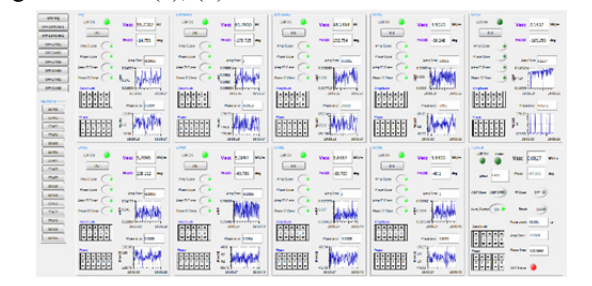
Figure 4: the main GUI control panel for injector I.

The IOC for LLRF control system include the amplitude and phase loop, tuner loop, interlock loop and monitoring loops for power meter vacuum meters etc. Figure 4 and 5 (a), (b) shows the GUIs.