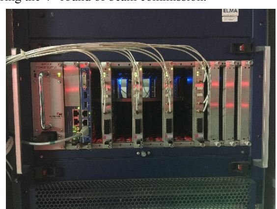
Figure 3: mTCA.4 platform.

We adopt the mTCA.4 based platform (shown in Figure 3) as the baseband signal processing and LLRF control interface for ADS project at IHEP. The digital signal processing platform SIS8300 is based on the digitizer originally designed by DESY and license to struck innovative system company [5]. We choose SIS8900 at the first beginning as the RTM since not sure about the performance of underdamping method on the constructed system and use 4 times sampling method for IQ control algorithm on FPGA. Up to now we have implemented the control algorithms on that platform and put them into practical operation on injector I. We are also updating the firmware and features on the platform to satisfy new requirement from operation. The amplitude and phase stability of electrical field in accelerate structure can be achieved around 0.1° and 0.1% (both are rms value) during the 4<sup>th</sup> round of beam commission.