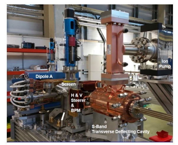
Figure 7: S-Band transverse deflecting cavity.