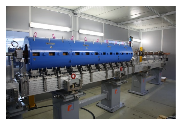
Figure 5: Modules M2 and M3.

noid parameters are given in Table 3 and 4 respectively. One of the two structures has been tested at high power and the design parameters in term of average accelerating field, RF pulse length and repetition rate have been met. Each module is equipped with four single plane steerers mounted at the entrance and exit of the accelerating structures. The steerers are assembled with a tilt of 90 degrees to allow horizontal and vertical beam correction. The multi-coil solenoid was designed at LNF and built by the Eurogammas subcontractor Danfysik. The solenoid is divided in four sections and each section contains an electric series of three coils. Each single coil can be individually aligned with respect to the magnet yoke because of its xyz mount and can be surveyed through reference fiducials exiting the iron yoke itself. The coil alignment and magnetic axis centering can be performed with the magnet powered on. The final tuning of the magnetic axis was performed at the Danfysik facilities within a precision of 80 microns RMS. The module 3 has a diagnostic chamber in between the two accelerating structure and two 75 l/s star cell ion pumps.