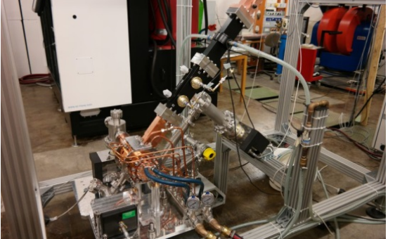
Figure 4: Picture of the S-band gun under high power test.