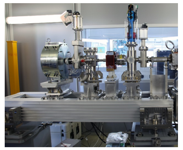
Figure 2: Module M1 without the gun installed.