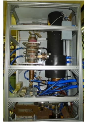
Figure 2: External view of 1 MeV accelerator.