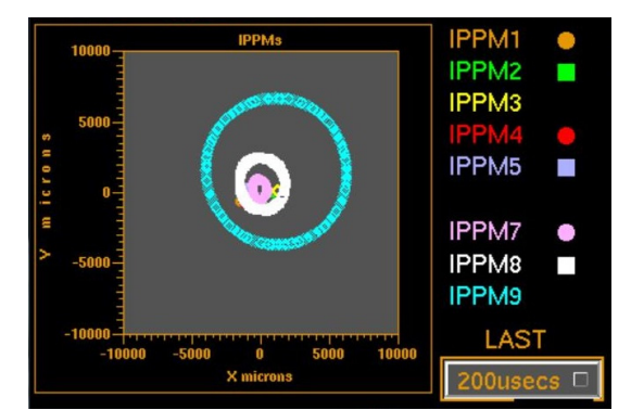
Figure 1: LANSCE isotope production beam position last 200 µs, raster patterned beam.