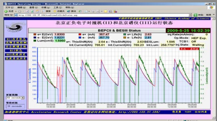
Figure 2: The dynamic web page of accelerator commissioning

Third type of the database is called the historical database. It is used to store all the historical data records at the minimum interval 120s since the accelerator commissioning. Their amounts of data are very large, and there is no limitation to the size of the database. These historical data can be used to the statistic and analysis, and also for the data sources of the data warehouse and data mining. In general, the clients visited the historical database only are few, even the amount of datum retrieved is very large, its influence to the system responses is transitory.