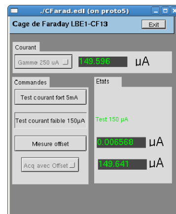
Figure 1: Display to manage different procedures.

An offset measurement procedure is available. It is done with beam cut off and then the current intensity is displayed with or without offset.