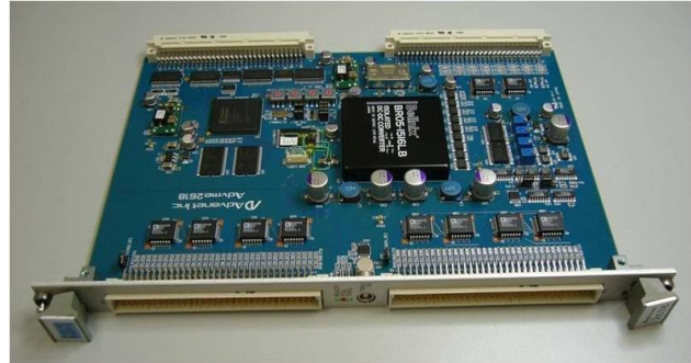
Figure 1: Developed AI board, Advme2618.

For the RF station A, we changed the signal cabling inputs from the VME bus-P2 side to the VME front side by using conversion card. Due to the high signal density, the number of AI boards could be reduced from 10 to 6. For further reduction in the number of AI boards, we plan to change the signal cabling inputs to the VME front side for the other RF stations as well in the near future.