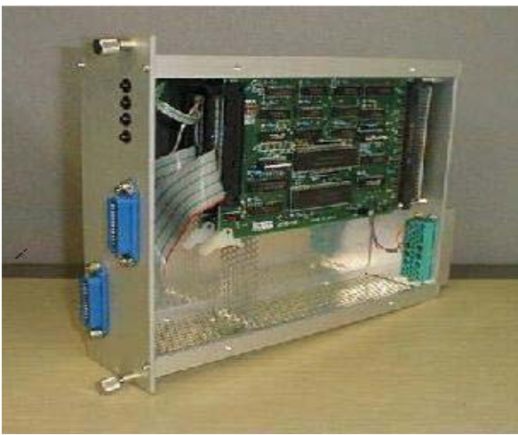
Figure 1. The GAC is assembled into a NIM module.

In controlling and monitoring the accelerator or the experimental physics, the GPIB is one of the useful field buses. When the primary address is used, one GPIB controller can control 30 devices. According to the specifications: (IEEE-488.1), one GPIB controller can control 960 devices when the extended two-byte address function is used. However, there is one inconvenience. There are many useful instruments equipped with GPIBs: oscilloscopes, multi-meters, and accelerator control devices. However, they are scarcely