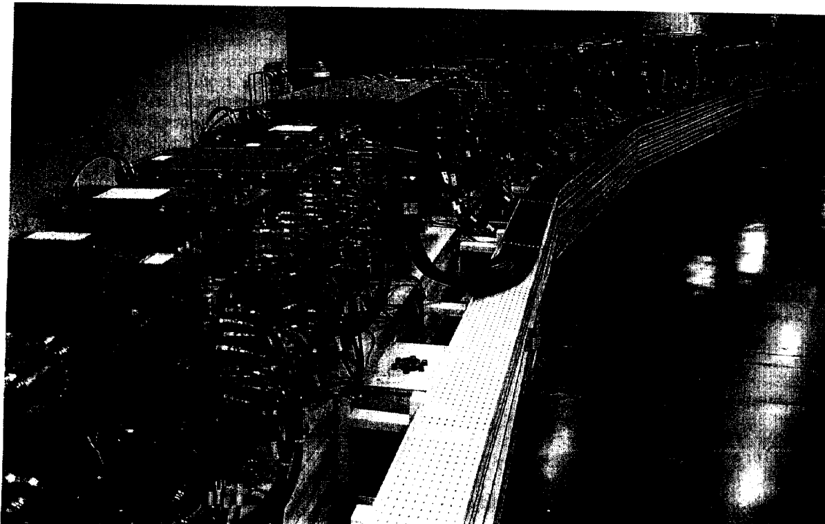
Fig. 1. Magnet assembly of one super-period of the storage ring.

The main design parameters of the magnets are listed in Tables 1 - 4. Magnetostatic calculations were carried out using POISSON and TOSCA group computer codes. The shapes of the magnet end along beam direction were decided by the method of trial and error for each type of prototypes.