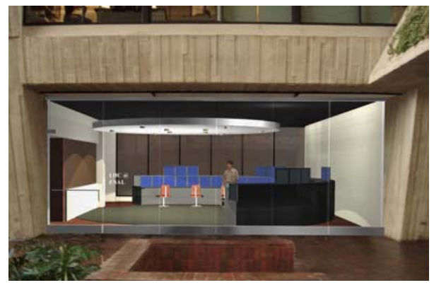
Figure 1, 3D rendering of the LHC@FNAL facility in the Wilson Hall Atrium at Fermilab

From these visits and scenarios, we have developed two types of requirements: those that address physical aspects of an operations center, and those that pertain to agreements and policies that need to be addressed by CERN, Fermilab, CMS, and the US-LHC Accelerator Research Program (LARP) [3] management. Requirements fall into four categories. The first two pertain exclusively to CMS and LHC, respectively. The third category addresses re-