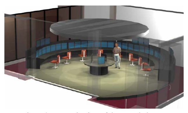
Figure 3, Isometric view of the console layout that can be used for access to personal email and video-conferencing. The entire console configuration encompasses 16 PCs and 40 LCD screens, and can easily be upgraded to double the number of PCs and/or add additional LCD screens.

LHC@FNAL can accommodate comfortably up to eight people, each with their own console PC and three LCD screens. These screens are located at eye level on the lower tier of a two-tier monitor-mounting system. Located on the upper tier, and centered between each pair of console stations, are three displays attached to a PC that is used to display data and information providing an overall status of the LHC accelerator and/or CMS experiment. Between each pair of console stations is one more screen located on the lower tier and attached to a PC