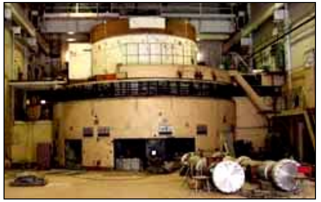
Figure 3: Reactor body.

technological systems as well as ion source characteristics. Heat-eliminating characteristics of existing resonators limit a value of beam current. At standard scheme of water cooling of resonators as well as 4-times increasing of RF system and injector power that corresponds to pulse beam characteristics of 220 µs duration 100 mA current and 100 pps repetition rate the value of the average beam current is supposed to be increased from 0.5 to 2.0 mA. It would increase the value of neutron intensity up to 1.2 \cdot 10^{15} n/s. The further beam current increasing is also possible at future advance in resonator cooling efficiency.