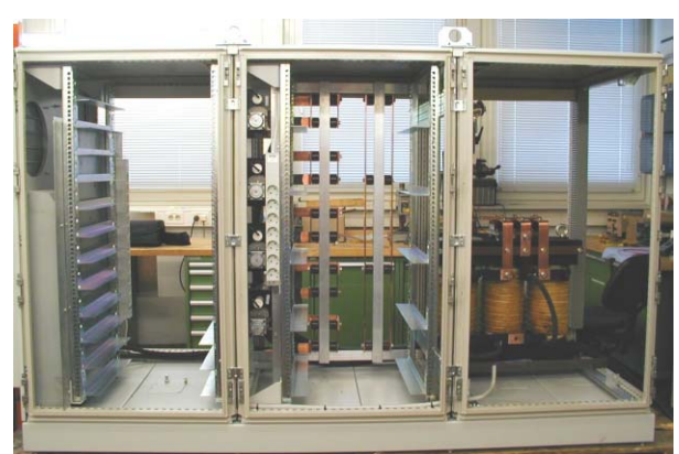
Fig. 3 Internals of the electronic racks

replaced by fast connectors and busbars (Fig. 4). For replacement the PS can be pulled and pushed. The overall repair time is reduced. Additionally it leaves the freedom of exchanging just the power part in the tunnel without exchanging the entire container.