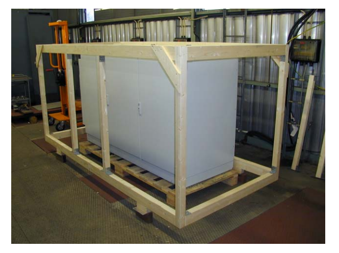
Fig. 2 Electronic rack with wooden mock up

mechanical stability in combination with the monorail is aimed for December 2002.