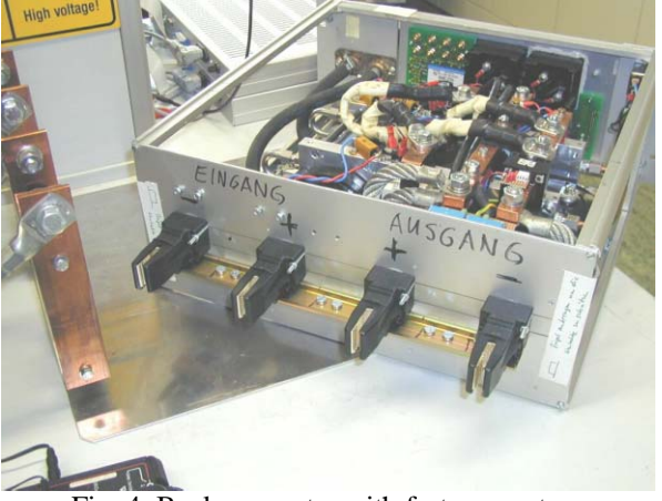
Fig. 4: Buck converter with fast connectors

The interlocking of the PS as well as the communication with the power supply controller is done via a PLC. A new type for the controls of the container is in development. It based on Siemens S7 and is programmed in STEP 7. There will be one PLC surveying all five power supplies.