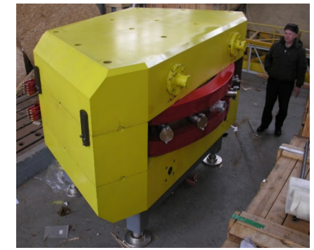
Figure 8: The switching magnet.

The magnetic beam focusing elements (quadrupole lenses, steering magnets) have been manufactured by the "N&V". The switching magnet with a vacuum chamber (Fig. 8) has been manufactured at the "NKMZ".Vacuum elements of the channels have been made at the "Vacuum Praha".