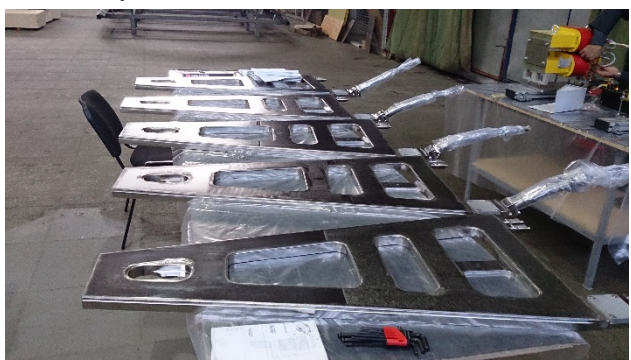
Figure 6: The blocks of azimuthal trimming coils.

The main magnet coils have been manufactured at the "N&V" firm, Romania. The block of radial trimming coils have been produced by the EVPU. The blocks of azimuthal trimming coils (Fig. 6) have been made at the GKMP, Bryansk, Russia.