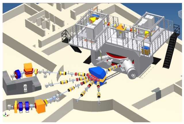
Figure 1: Layout of the DC-280 in the SHEF building (see Fig. 2).

The cyclotron ion beam extraction system the will be equipped with an electrostatic deflector and a passive focusing magnetic channel (Table 1).