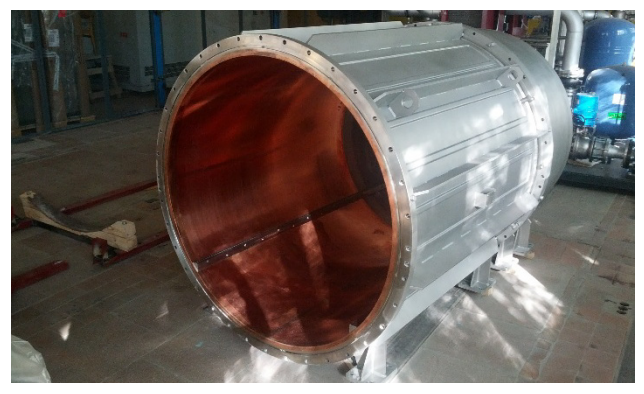
Figure 4: The RF resonator.

The RF resonators (Fig. 4) with shafts have been manufactured at the "ZAVKOM" plant, Tambov, Russia. The main dees (Fig. 5) have been made at the EVPU, Slovakia. The flat-top dees are being manufactured at the JINR. The RF generators have been made by the QEI Corporation, NJ, USA.