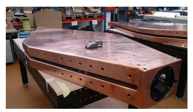
Figure 5: Copper dees at the EVPU.