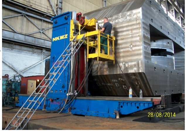
Figure 3: The main magnet of the DC-280 at plant.