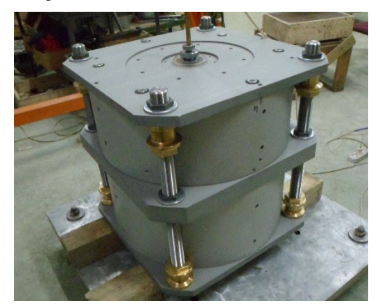
Figure 7: The DECRIS-PM magnetic system.

At the first stage, we are creating only one HV planform with the DECRIS-PM ion source. The HV platform will be manufactured and tested at the FLNR. The DE-CRIS-PM magnetic system has been produced by "ITT-Group", Moscow, Russia (Fig. 7). The ion source will be assembled and tested at the FLNR. The beam focusing solenoids and the analyzing magnet (AM) of the injection channel are being manufactured at the EVPU. The 75 kV acceleraton tube was supplied by the "NEC" company, USA. All vacuum elements of the channel, such as vacuum lines, the AM vacuum chamber, diagnostic boxes, the Einzel lens, the electrostatic bender and the polyharmonic buncher have been made at the "Vacuum Praha" firm, Czech Republic.