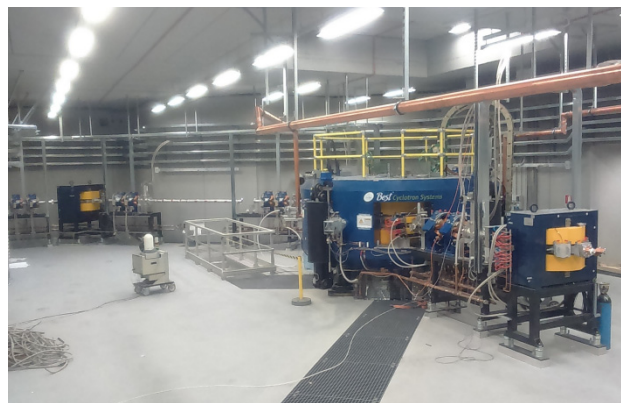
Figure 1: Picture of actual installation at SPES building of LNL.

The cyclotron and the beamline (see Fig. 1) have been supplied and installed by BCSI on 2015. The cyclotron is a 4 straight sectors machine, accelerating H^+ ion that are extracted by the stripping process to get the proton beams. In order to minimize losses due to the Lorentz stripping during the acceleration, the cyclotron operates with a peak magnetic field of 1.6 T. The extraction radius is about 1300 mm and total weight is 160 tons.