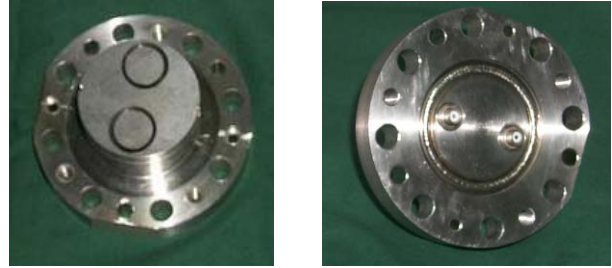
Figure 1: The BPM for SSRF storage ring

The vacuum chamber of SSRF storage ring is ellipsoid, with the 40 mm on the vertical dimension, 70mm on the horizontal dimension. Taking account of the heating problem of the pickup power and the enough sensitivity of beam position, we adopted a small diameter ( \Phi 15\text{mm} ) of the electrode. To reduce the mechanical surveyment for the BPMs with the same vacuum chamber dimensions, we designed the new BPM structure, as shown in figure 1.