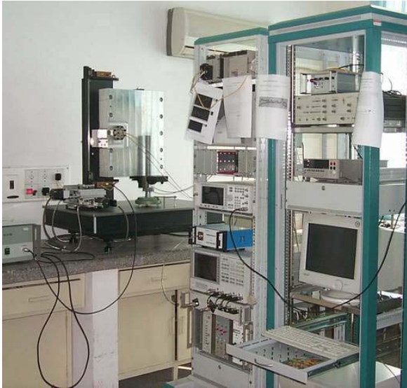
Figure 2: The calibration stand of SSRF BPM

movement of the position stables according to the position value measured by the encoder.