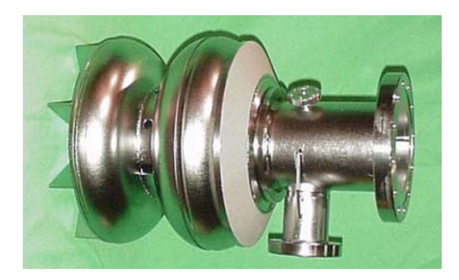
Figure 2: The Pb coated gun cavity.

an average current below 1 mA. This gun contains a 1.6 cell 1.3 GHz SRF gun cavity. The back wall has a small area coated with Pb used as the photocathode (see Figure 2).