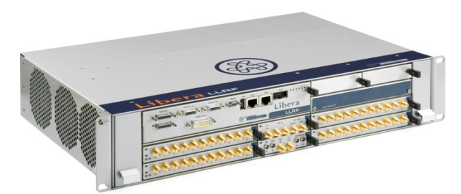
Figure 1: front and side view of Libera LLRF.

The Libera LLRF system was designed and developed to be modular and configurable, with the aim to fulfil various requirements from different accelerators. Fourth generation light sources have especially stringent requirements in terms of stability. A challenge of such systems can arise from the need to stabilise RF pulses of short duration