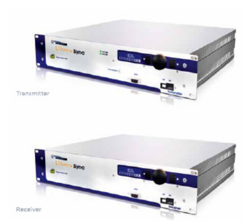
Figure 4: Libera SYNC.

With this goal in mind the Libera SYNC system was developed.