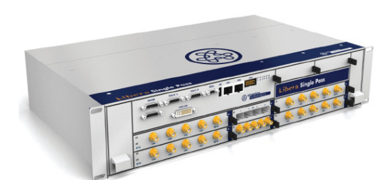
Figure 2: Libera Single Pass H.

Libera Single Pass H is a new generation of single pass monitor that is designed for proton or heavy ion LINACs. Beside the position of the beam it also measures the phase of the particles.