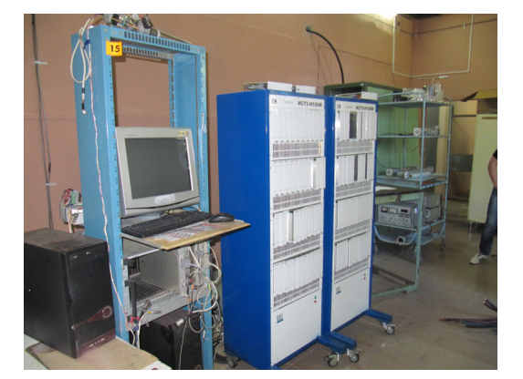
Figure 4: NESTOR facility storage ring magnetic elements power supply control system.

Figure 3: NESTOR facility linear accelerator control system screen short.