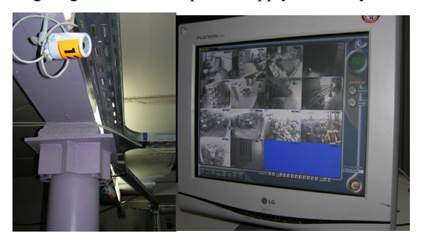
Figure 6: Elements of video monitoring system.