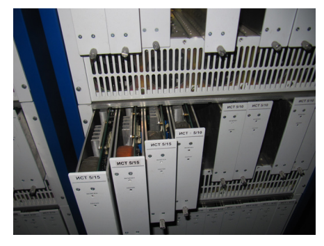
Figure 5: Programmed power supply sources of storage ring magnetic elements power supply control system.