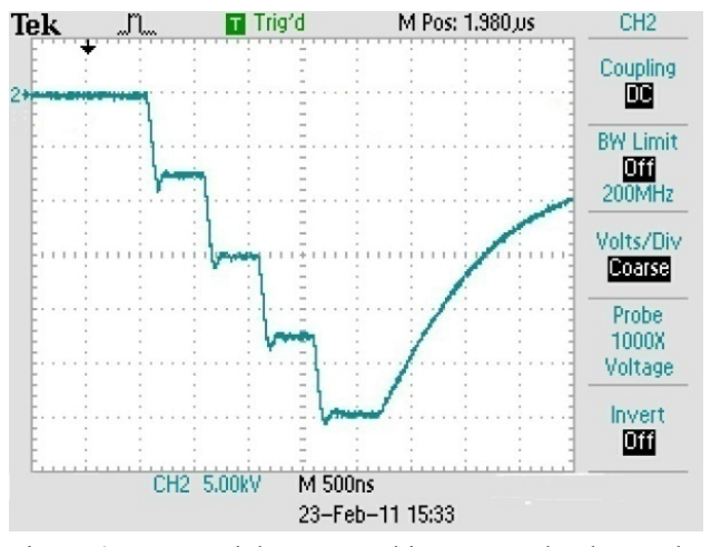
Figure 4: Four modules operated in staggered pulse mode, showing the individual control of each module.

During testing of the prototype bank, we ran all four gates synchronously for a 1.5 \mu s pulse, with a 10 kV precharge into the system, resulting in a 40 kV output. The prototype modules performed flawlessly into high voltage, with none of the chatter or jitter that would otherwise be associated with gate drives impacted by noise coupling at high voltage. We then demonstrated the pulse-staggering capability of the Marx design by delaying the successive modules by 0, 0.5, 1.0, and 1.5 \mu s on a 2.3 \mu s pulse with a 7.5 kV pre-charge (Fig. 4). The distributed effect of the snubbing RL networks is clearly apparent here, with the fractional overshoot visible as each successive stage turns on into the high impedance load.