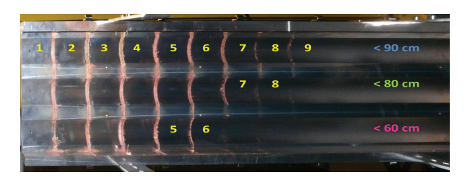
Figure 3: Top cover of the experimental set-up after the irradiation. Traces of projected copper between the 10 cm long cylinders of the targets indicate the length of the melting zone. For target 1 (bottom) the molten zone ends in the 6th cylinder, i.e. the copper was molten over a length of 55\pm 5 cm. For target 2 (mid) the molten zone goes up to cylinder 8, i.e. 75\pm 5 cm. For target 1 (top) the molten zone goes up to cylinder 9, i.e. 85\pm 5 cm.