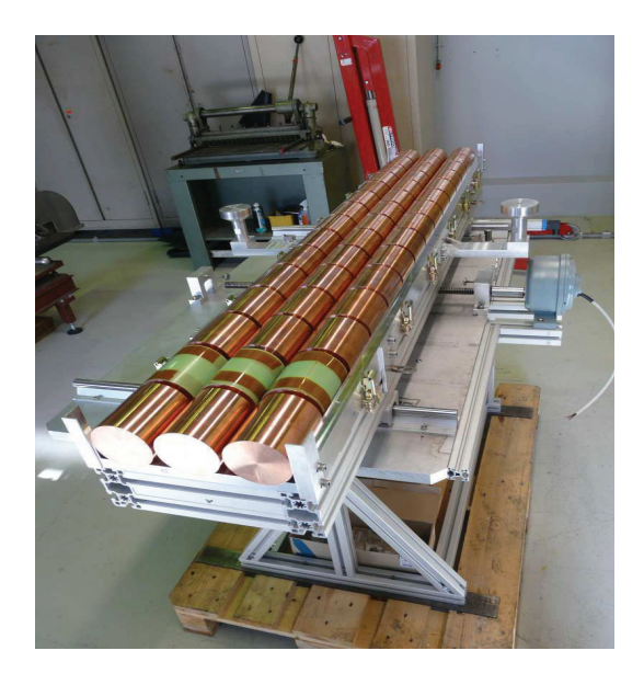
Figure 1: Target with 3 assemblies, each with 15 copper cylinders. The aluminium enclosure and caps are not shown.