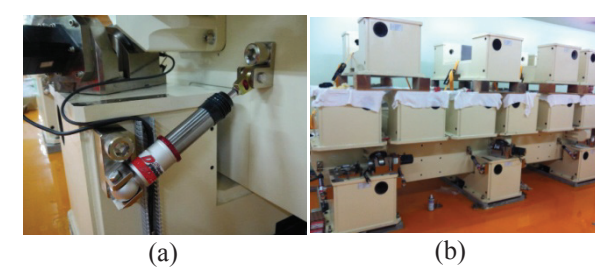
Figure 3: Photographs of the modal testing of a girder.

To increase the natural frequencies and to reduce the level of girder vibration, we apply the multi-stage adjustable damping absorbers under the assembly of the girders reduced the level of girder vibration, and modal testing can then be performed. In addition, to simulate the weight (around 10 ton) of magnets practically acting on a girder in TPS storage ring, we stack 10 pedestals on the girder (G1) by operating two gantry cranes, as shown in Figure 3. An impulse force serves as the excitation input acting on the point 6 of the girder (G1), as shown in Figure 4. The measured acceleration responses of a girder system will be obtained from accelerometers, as shown in Figure 5, and the corresponding frequency response function acceleration data for each measured point are shown in Figure 6. In Figure 6, we clearly see that the level of girder vibration is somewhat reduced and most peaks of modes of the girder (G1) moved right when installed the multi-stage adjustable damping absorbers, especially for the lower modes, such as 1st, 2nd, and 3rd modes, due to that their contribution to the system response is somewhat more than that of the higher modes of a system.