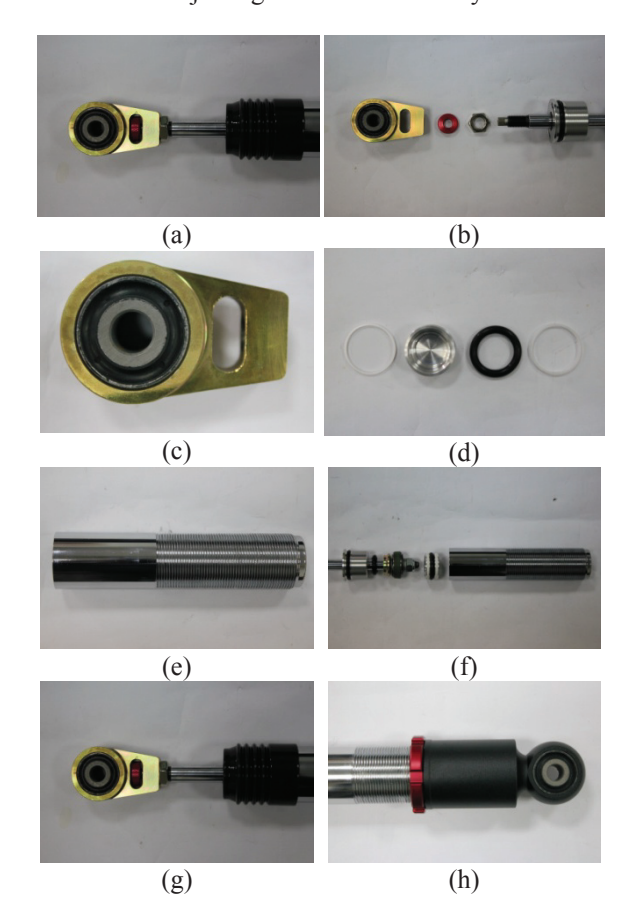
Figure 2: Components of a hybrid damper.

the gas chamber, which effectively shows that the gas pressure, which is a function of the floating-piston displacement, affects the pressure in the compression chamber. Considering an additional force that can adjust the movement of the floating piston, the pressure in the compression chamber will be regulated. Consequently, the force that is generated by the adjusting member within a cylinder that is used to restrict the movement of the floating piston plays an important part in causing the pressure differences; hence, the damping force that is augmented by an additional force produces a pressure drop across the damper piston assembly. The augmentation will be accomplished through control of the rotation of the adjusting member within a cylinder.