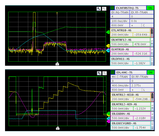
Figure 2: Injection into LEIR. Top (100 \,\mu\text{s/div}) : the 200 \mu\text{s} linac pulse (yellow/magenta: current in transfer line) is accumulated (green: current in LEIR) over 70 turns (cyan: injection bumper). Bottom (400 ms/div): the process is repeated 7 times (yellow/green: current in LEIR), then the electron cooling is turned off (cyan: grid electrode) and acceleration starts (magenta: magnetic field).

The beam is then bunched on h = 2, accelerated to 72 MeV/u and transferred to the Proton Synchrotron (PS). In the PS, the bunches are accelerated to 4.2 GeV/u. They are then successively subjected to a batch expansion (h = 16, 14, 12), a rebucketing (h = 12, 24), another batch expansion (h = 24, 21) and a final rebucketing (h = 21, 169). The two resulting bunches, spaced by 200 ns, are then transferred to the Super Proton Synchrotron (SPS). The ions are fully stripped to Pb<sup>82+</sup> by a 0.8 mm thick AI foil in the transfer line. This operation is repeated 12 times, every 3.6 second – the duration of the LEIR cycle – in order to fill the SPS with 24 bunches, equally spaced by 200 ns, thanks to a shortened injection kicker rise time. To fill the LHC with 2×358 bunches, 15 such trains are injected in each ring.