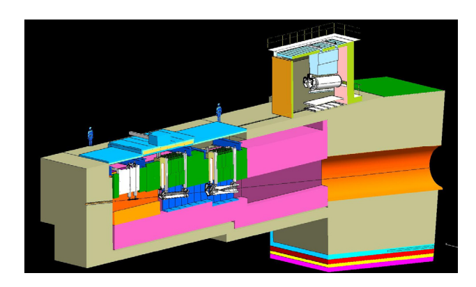
Figure 2: Section of the Target Hall complex and the Decay Pipe.

boundary is about four orders of magnitude below the LBNE related allowed dose of 1mrem/year.