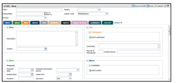
Figure 2: IMPACT activity request form.