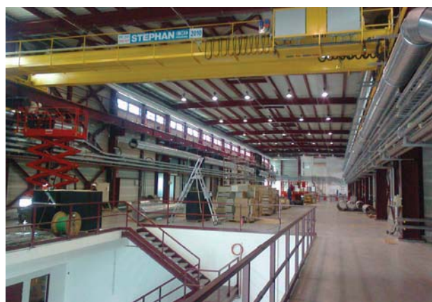
Figure 2: Infrastructure installation (Summer 2011).

Infrastructure is presently being installed (electricity, cooling and ventilation, cabling...) (Fig. 2). At the end of this phase, in June 2012, the installation of the accelerator components will begin.