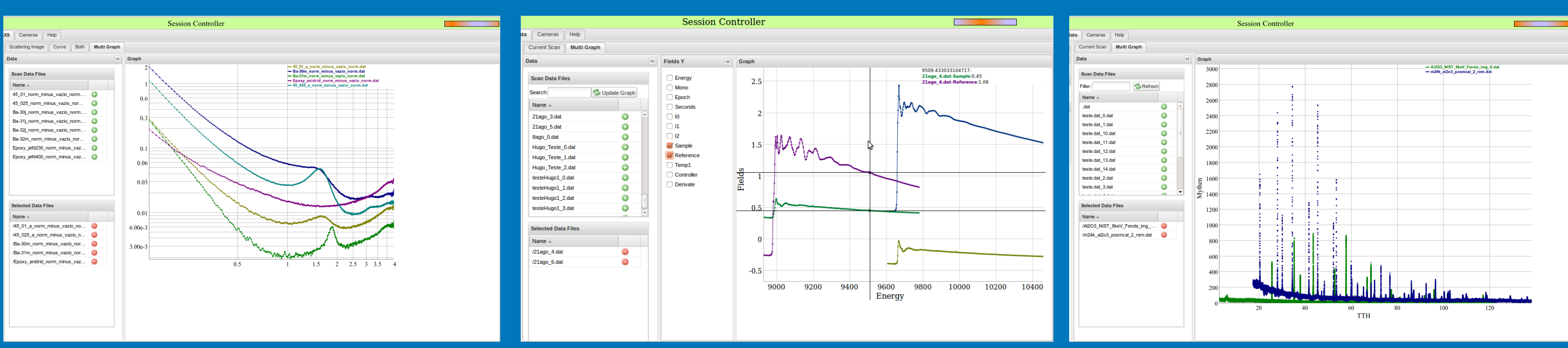
Figure 4: SAXS1, XAFS1 and XRD1 Data View Tab