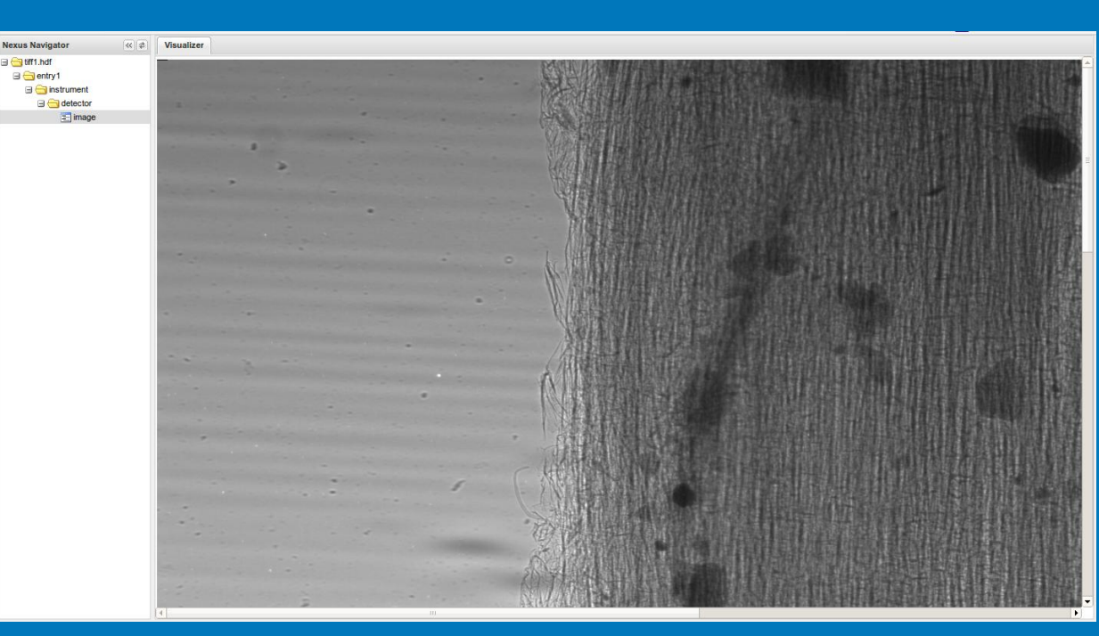
Figure 8: Example of Graph Data and Image of a HDF File generated at LNLS