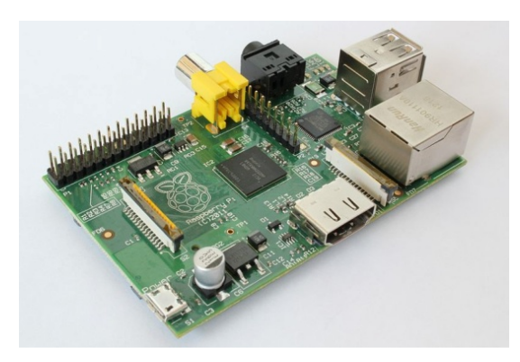
Figure 7: Rasberry Pi.

The Rasberry Pi platform is a very low cost and ideal for learning about Tango and doing demonstrations.