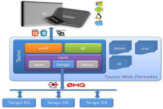
Figure 6: Browser based web solution.

Inside the web server the Taurus web module takes care of translating Tango data into events on the web socket. Dependent on the underlying Tango server Taurus will switch automatically from polling to an event based communication schema to refresh data on the web page.