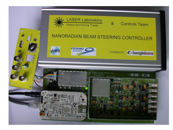
Figure 8: Beagle Bone development at ELETTRA.

The Beagle Bone is ideal for embedding Tango in production serious projects. Development projects are ongoing at ELETTRA and ESRF.