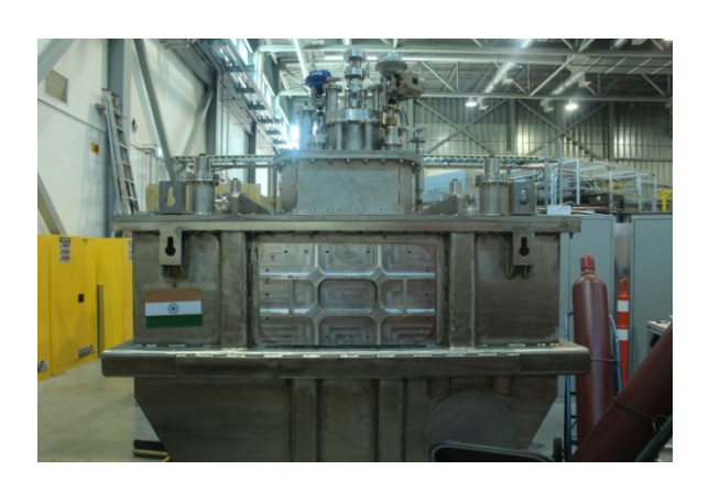
Figure 5: Injector Cryo Module for the VECC superconducting Electron Linac (e-Linac) at TRIUMF.

The superconducting electron accelerator (e-Linac) [18], presently under development jointly with TRIUMF, will be the main driver accelerators for ANURIB. An identical machine is being built at TRIUMF for the ARIEL-Advanced Rare Isotope Laboratory project. In the e-Linac, electron beam from a 300 kV thermionic gun will be accelerated first to 10 MeV in an Injector Cryo-Module (ICM) housing one 1.3 GHz, 2K 9-cell cavity. The 10 MeV electron beam would be then accelerated to 50 MeV in two Accelerator Cryo-Modules (ACM) each housing two 9-cell cavities. Last year in a test run at TRIUMF, electron beam has been accelerated to 23 MeV using the ICM and one nine cell cavity inside the ACM1. A second ICM meant for VECC is presently under construction at TRIUMF (figure 5.) and is scheduled to be tested in early 2016.