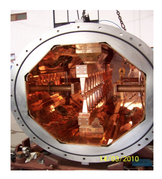
Figure 3: Photograph showing third heavy-ion Linac module with the front cover open. Designed at VECC this linac was fabricated in an industry at Bangalore.

The RIB production and acceleration scheme in ANURIB is shown in figure 4. A 50 MeV, 100 kW cw electron linac and a high current proton accelerator would be the driver accelerators for production of neutron-rich & proton-rich isotopes. The facility has been planned such that experiments can be done at each stage of development. The physics opportunities that will open up at various stages are indicated in figure 4. After initial acceleration in RFQ and room temperature linacs, Superconducting Linac Boosters (SLBs) will increase the beam energy to around 7 MeV/u opening up the regime of coulomb barrier physics and production of Super Heavy Nuclei (SHE) using RIBs as well as Stable Ion Beams. For ANURIB a novel acceleration scheme using Asymmetric Alternate Phase Focussing will be employed in the SLBs that would allow simultaneous acceleration of multiple charge states of heavy-ions [15, 16].