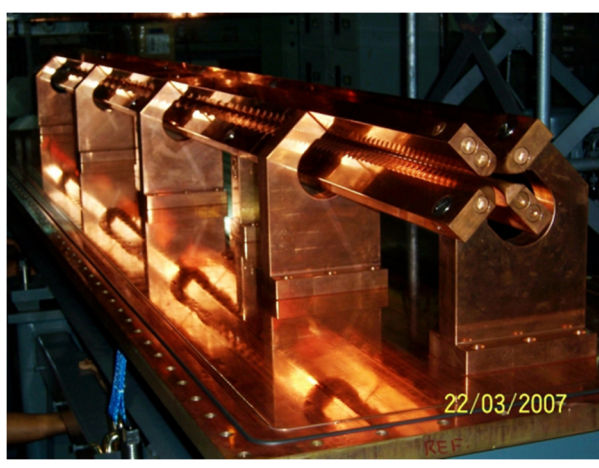
Figure 2: Photograph of the internal post-vane structure of 3.4 m long RFQ linac taken during installation at VECC.

Experiments to study decay spectroscopy of short-lived nuclei are being planned / carried out using the low energy RI Beams. These efforts together with accelerator design and development have so far led to about 60 publications in Journals and 7 PhD theses.