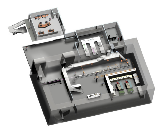
Figure 1: The MEGa-ray facility.

The nascent field of nuclear photonics is enabled by the recent maturation of new technologies, including highgradient X-band electron acceleration, robust fiber laser systems, and hyper-dispersion CPA [1]. Recent work has been performed at LLNL to demonstrate isotope-specific detection of shielded materials via NRF using a tunable, quasi-monochromatic Compton scattering gamma-ray source operating between 0.2 MeV and 0.9 MeV photon energy. This technique is called Fluorescence Imaging in the Nuclear Domain with Energetic Radiation (or FINDER). This work has, among other things, demonstrated the detection of <sup>7</sup>Li shielded by Pb, utilizing gamma rays generated by a linac-driven, laser-based Compton scattering gamma-ray source developed at LLNL [2-4]. Within this context, a new facility is currently under construction at LLNL, with the goal of generating tunable \gamma -rays in the 0.5-2.5 MeV photon energy range, at a repetition rate of 120 Hz, and with a peak brightness in the 10<sup>20</sup> photons/(s x mm<sup>2</sup> x mrad<sup>2</sup> x 0.1% bw).