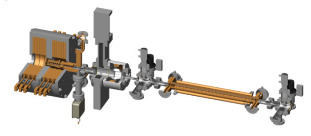
Figure 3: X-band rf gun, LEB, and T53 section.

The rf photoinjector is based on an earlier high gradient 7 MeV, 5.5-cell X-band rf photoinjector. Improvements specific to our application have been implemented and will be described in this paper. PARMELA simulations revealed that a longer first half- cell, as simulated with SUPERFISH resulted in a lower final emittance for the setup planned at LLNL. As a result a full redesign of the rf gun has been performed, using a longer first half-cell, lengthened from a 0.49 cell to a 0.59 cell. A schematic of the gun, low-energy beamline (LEB) and T53 is shown in Fig. 3.