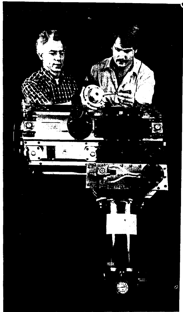
Fig. 3 Photograph of the fully assembled RFQ.

The authors wish to acknowledge the substantial contributions of S. Abbott in mechanical design, the able mechanical assistance of B. Wright in fabrication and assembly, and the help of J. Galvin in the reduction of alignment data. In addition, the excellent support provided by the LBL machine and plating shops is gratefully acknowledged.