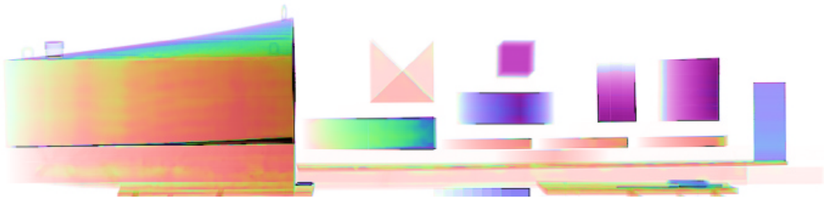
Picture 4 Recognition of tested samples (from left to right): 110cm wedge-like tank with water, 200cm wooden wedge, 35cm aluminum wedge, plexiglas samples, lead sample, 15cm steel wedge, three 50cm plastic wedges, 4.5cm tungsten wedge, 9cm lead wedge, 5cm steel plate. Color encoding is according to table 1 (colored representation is available in electronic version of the paper only).