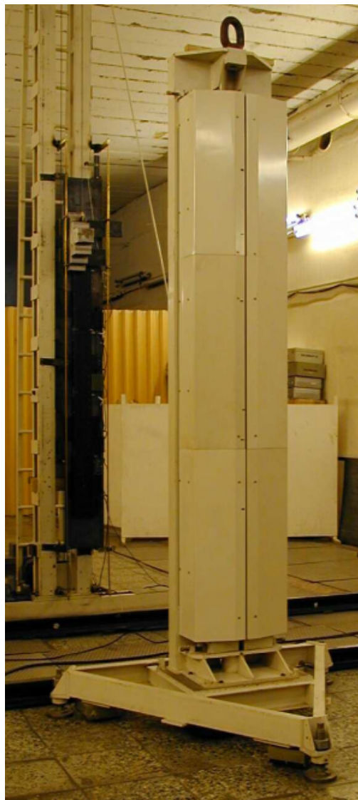
Picture 1 Slit collimator, detector line and guide rails of transportation system for examination of container.

The accelerator operates at so-called interlaced mode, when each even pulse generates 8MeV electron beam and odd – 4MeV. Pulse duration - 5 \mu sec, repetition rate – 100Hz, average current - 100 \mu A. In the output target the electron beam is converted into bremsstrahlung. System of slit collimators (picture 1) forms narrow fan-like vertical X-ray beam. Detector line scintillation crystals coupled with p-i-n diodes are used.