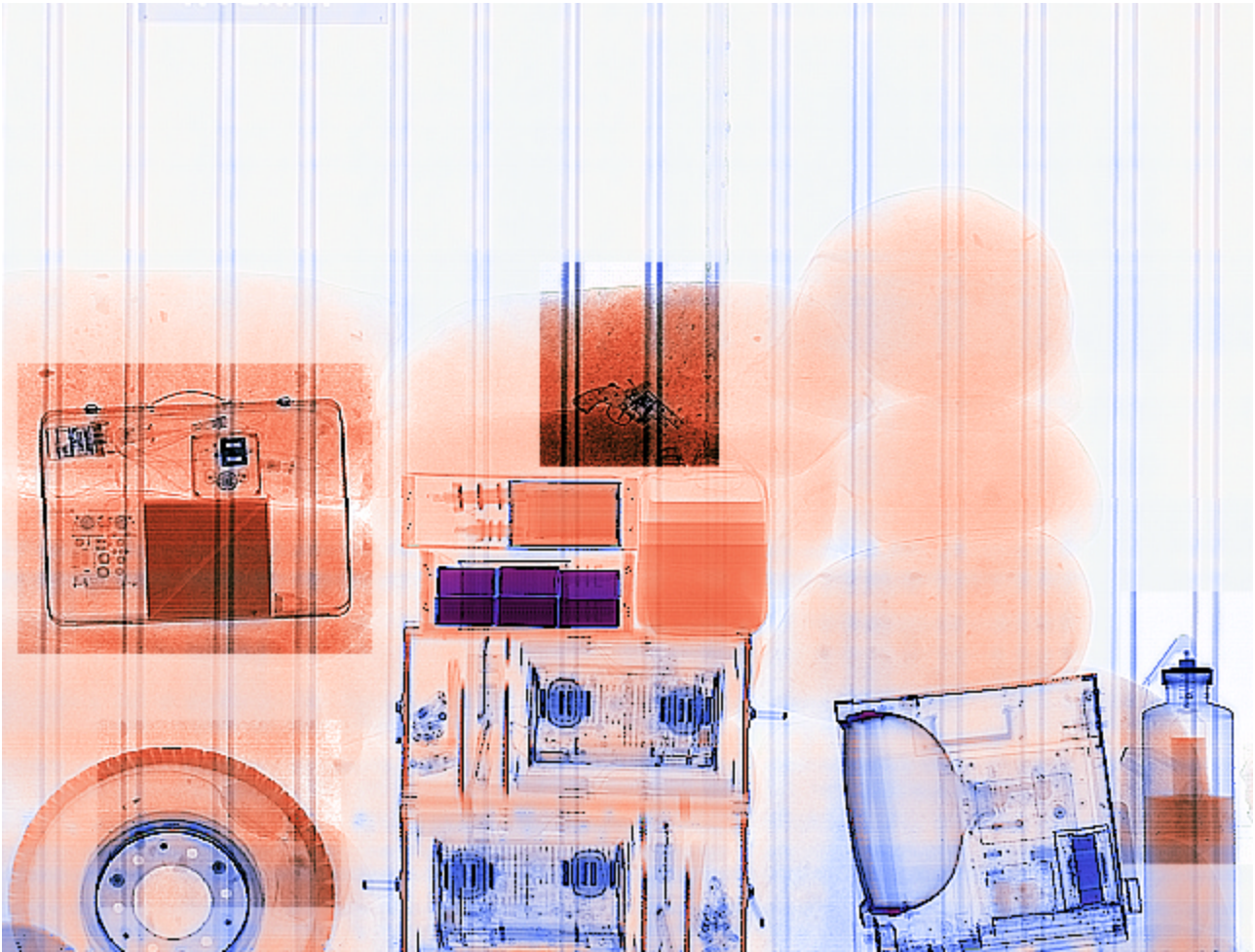
Picture 5 Colorized image of the transport container filled with sawdust sacks. The following items are included also: suitcase with plastic, truck's wheel, 3cm and 5 cm lead bars, three 20cm plastic tanks with petrol, TV-set, fire extinguisher. Color encoding: organic – red, inorganic – blue, heavy metals – lilac (colored representation is available in electronic version of the paper only).