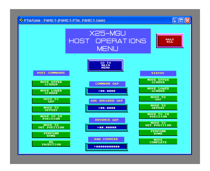
Figure 2: Touch Panel Display generated by ADC