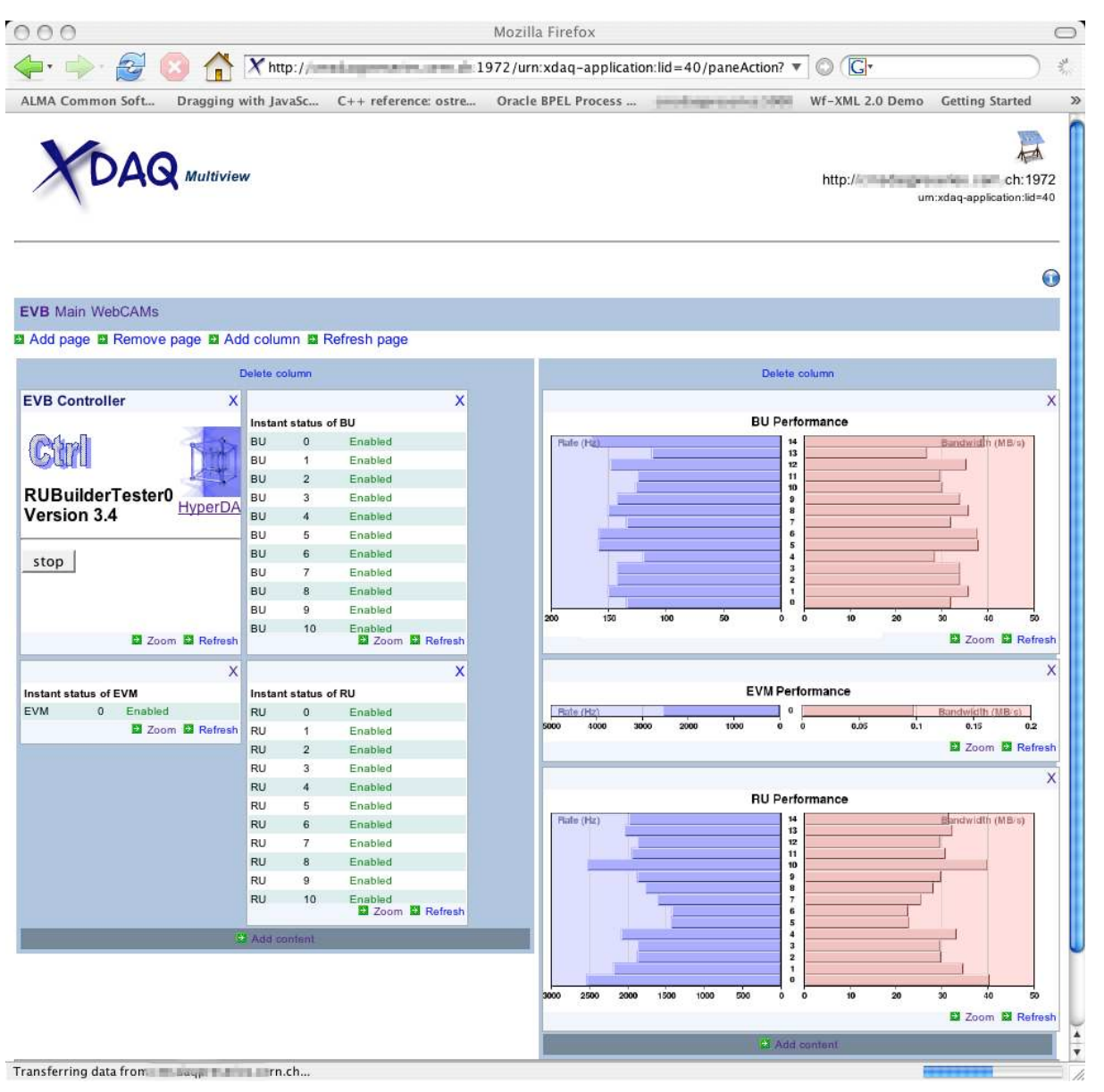
Figure 2: Monitoring data from a cluster of 33 computers presented through HyperDAQ in a browser.