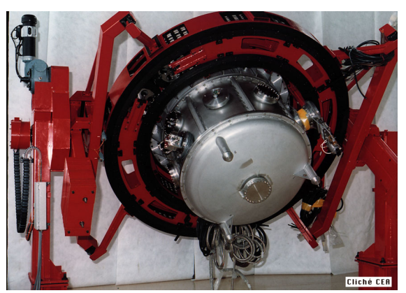
Fig. 1 VISIR mounted on the integration support

is 1.20m and the total weight of the instrument will be 1000 kg.