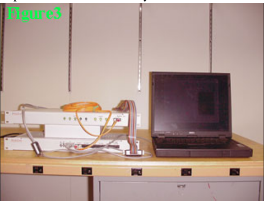
Figure 3 – Standalone PSC Configuration

manufacturers to check that their equipment is compatible with the control system.