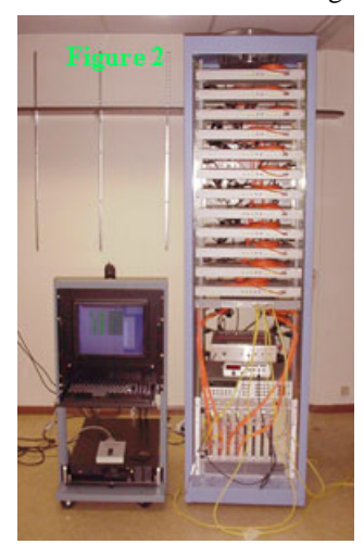
Figure 2 is the configuration of a lab setup used to test the hardware under high load conditions. There is

an IOC with 8 PSCs with 24 PSIs connected to four of the PSCs. The PSCs are using external triggers to read and write to the PSIs. The trigger rate is set at 4000Hz in this example to test operation under high load. For each PSI, the output voltage is fed back to the input connectors the and output commands are fed back to the status input to simulate a power supply.